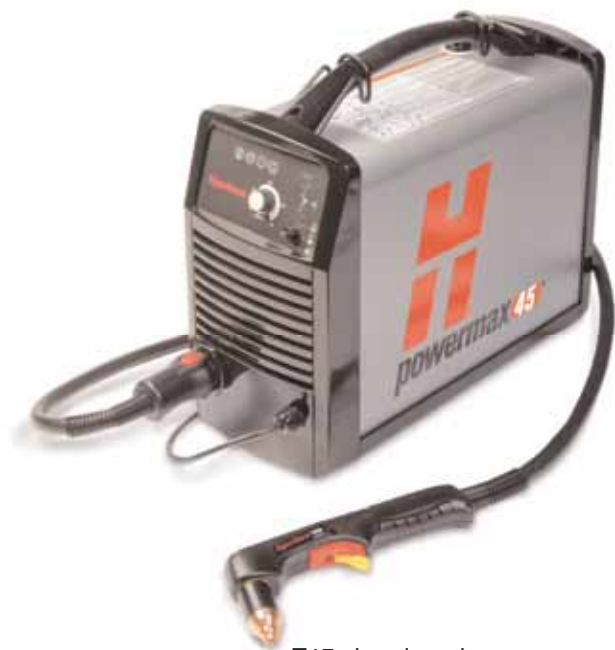
T45v hand torch