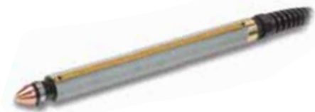
T45m machine torch